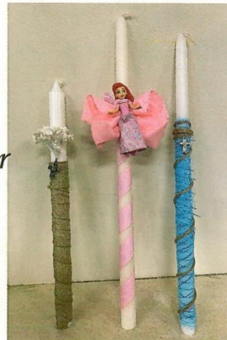
$20 per Lambatha

Proceeds will benefit Philoptochos philanthropic endeavors